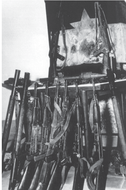
A portion of the Viet Cong AK-47 assault rifles, RPG-7 launchers, and a flag captured by 7th Air Force explosives ordnance disposal personnel during an attack on the Tan Son Nhut Air Base.